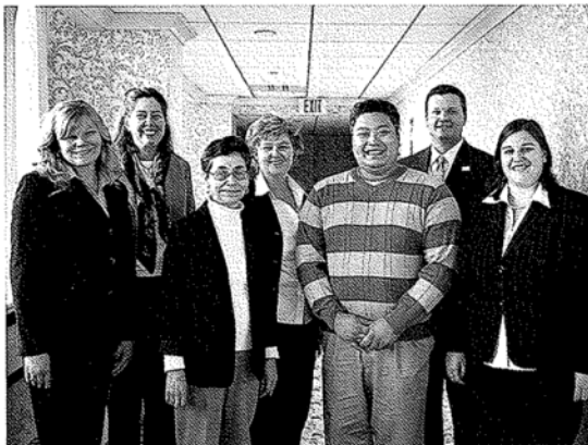
Representatives from the Patient Advocacy Groups